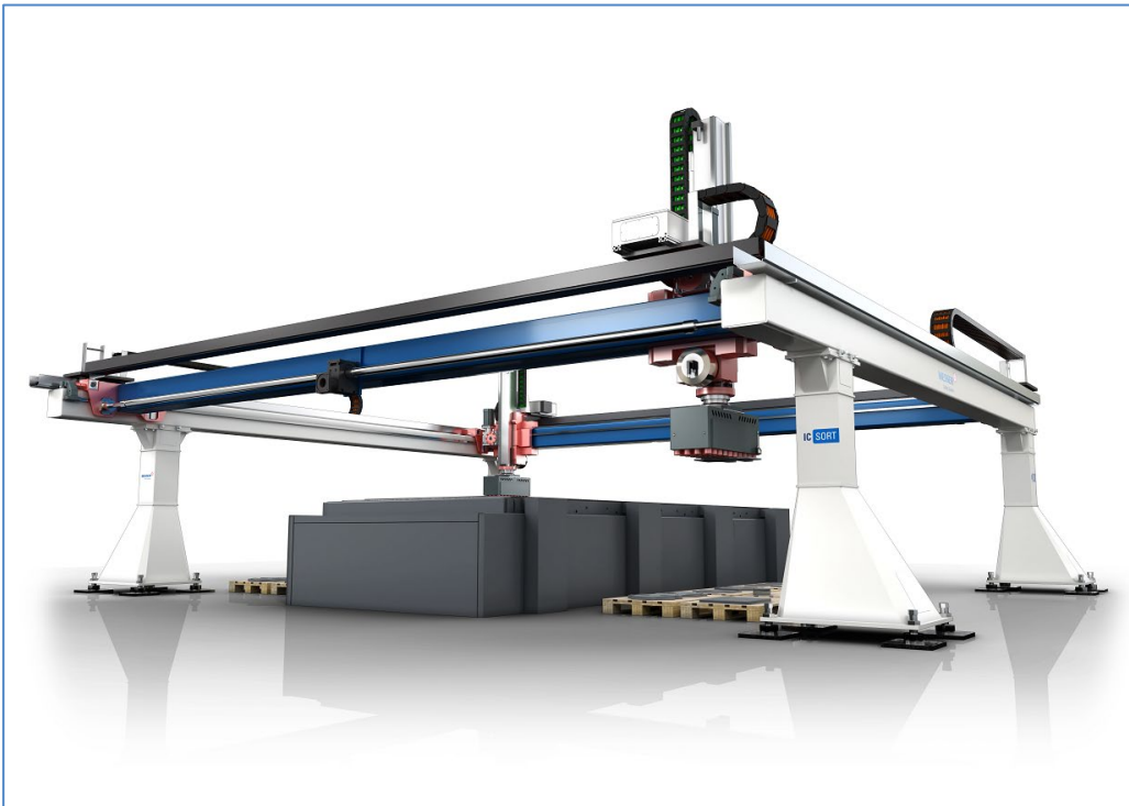
Figure 3: IC Sort Loading, Unloading, and Sorting System